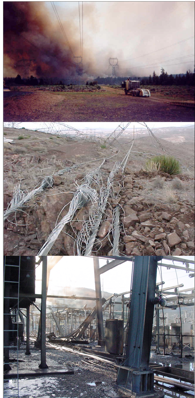
Figure 1. Automate/integrate physical, computational platform and real-world constraints to address threats and lessons learned.

Critical energy infrastructures and essential utilities have been optimized for reliability under the assumption of a benign operating environment. Consequently, they are susceptible to cascading failures induced by relatively minor events such as weather phenomena, accidental damage to system components, and/or cyber attack. In contrast, survivable complex control structures should and could be designed to lose sizable portions of the system and still maintain essential control functions [11]. For example, in [17], the Aug. 10, 1996 cascading blackout is studied to identify and analyze common mode faults leading to the